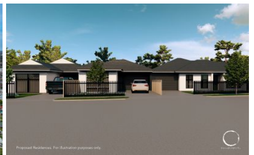
Proposed Residences. For illustration purposes only.