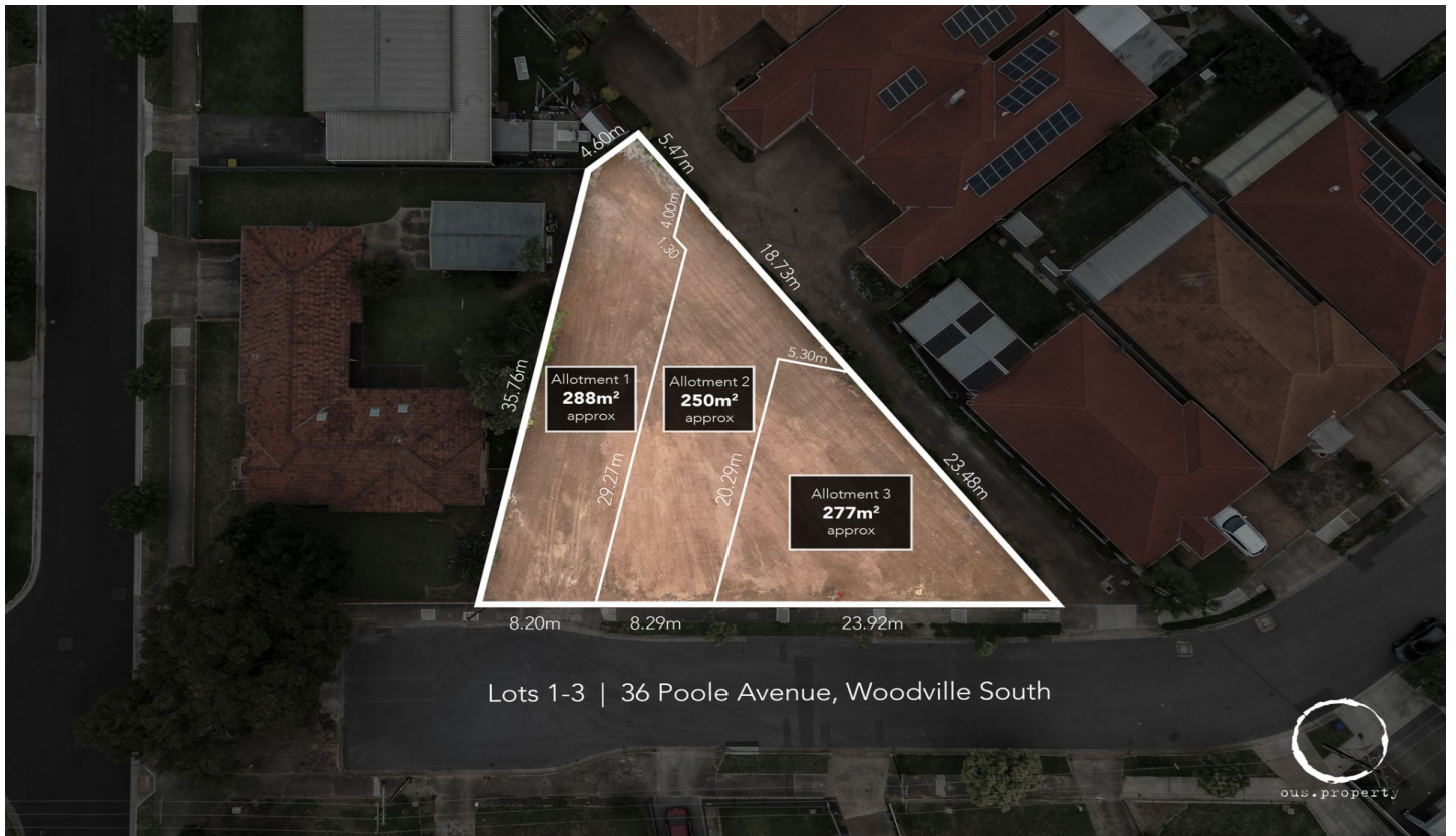
Lots 1-3 | 36 Poole Avenue, Woodville South