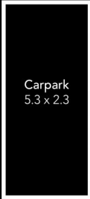
Carpark 5.3 x 2.3