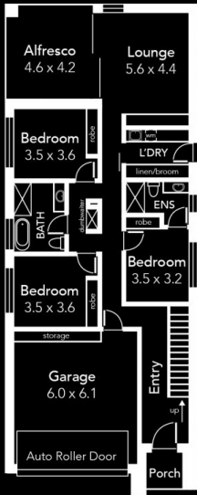
Lower Level Residence 1