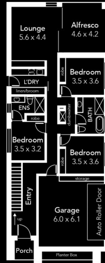
Lower Level Residence 2