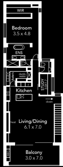
Upper Level Residence 1